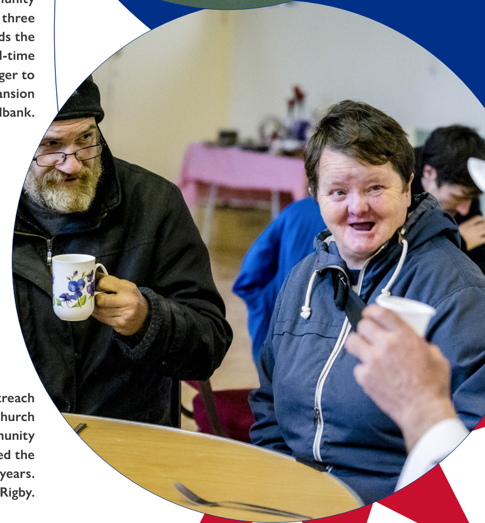
Cumbria Gateway outreach breakfast at St Aidan's church hall, Carlisle. Cumbria Community Foundation have supported the organisation over several years.