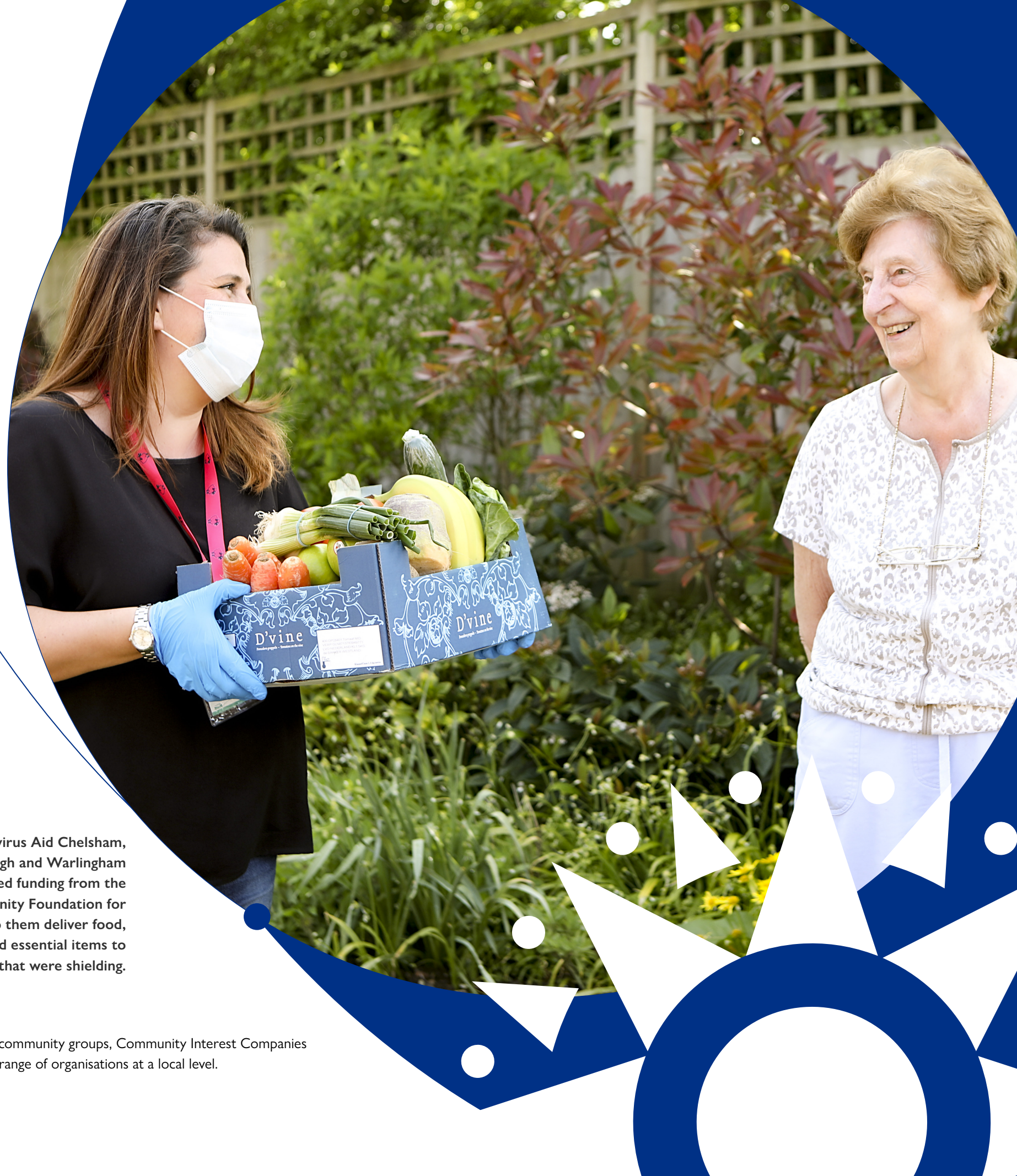
Coronavirus Aid Chelsham, Farleigh and Warlingham received funding from the Community Foundation for Surrey to help them deliver food, medication and essential items to people that were shielding.