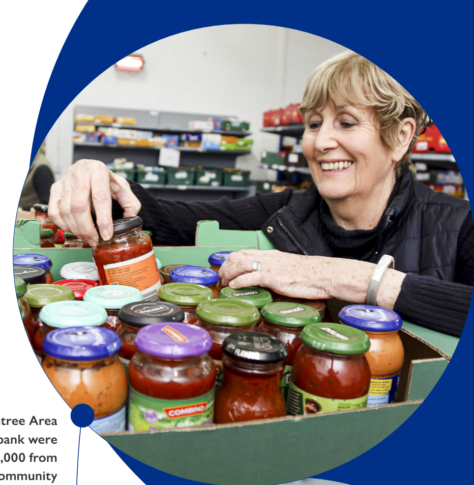
Braintree Area Foodbank were awarded £40,000 from Essex Community Foundation, over three years, towards the salary of a full-time Project Manager to manage the expansion of a busy foodbank.

What is evident is that the closures and the scaling back of the services that local VCOSs provide will have a huge and varied impact, leaving many communities incredibly vulnerable as we approach an uncertain economic future.