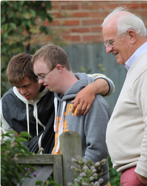
Golden Lane Housing, investment through Threadneedle Social Bond Fund

With the exception of Cook, these are all investments which I may not have been tempted to make because I like to go for different sorts of risk in my own name.