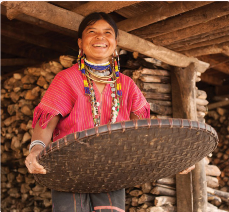
Alterfin, direct social impact investment

My experience has been positive so far and I hope to make more social impact investments on a more regular basis later in life. I would definitely recommend other donors to consider using DAF to make social investment.