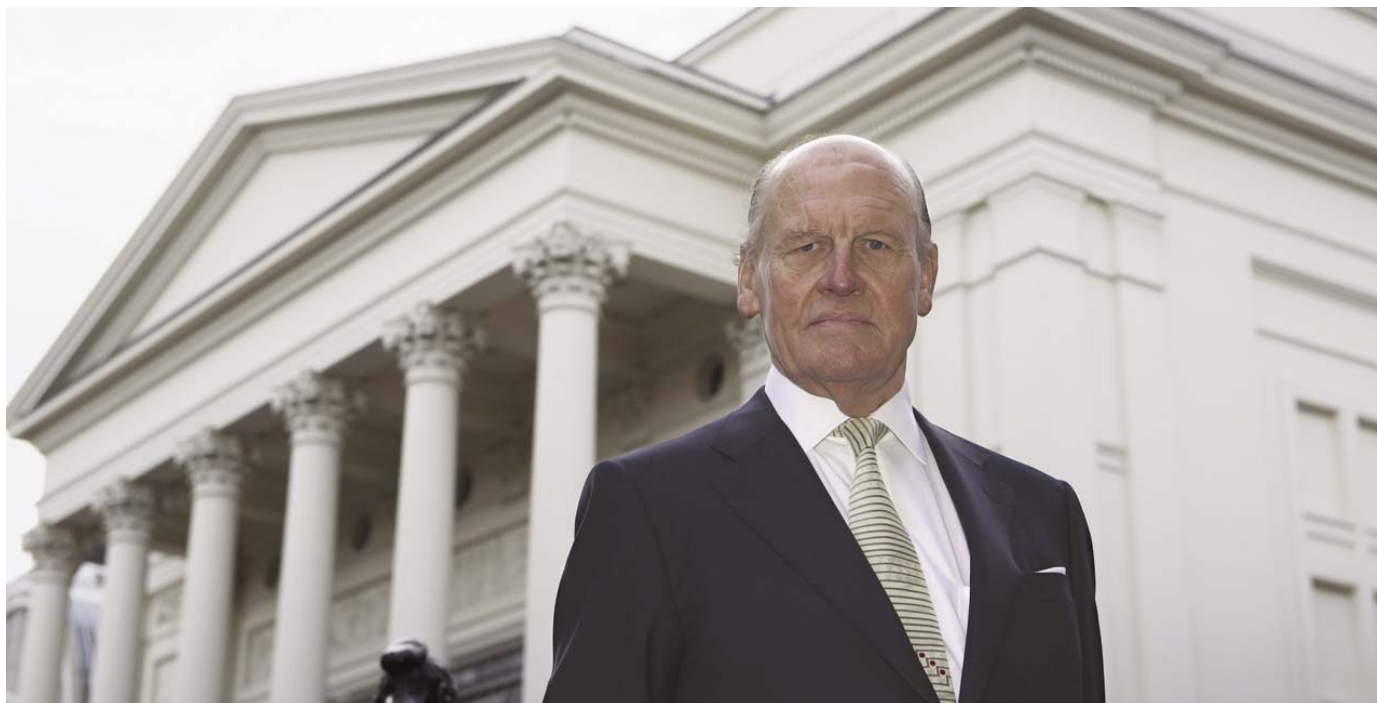
Alec Reed CBE.