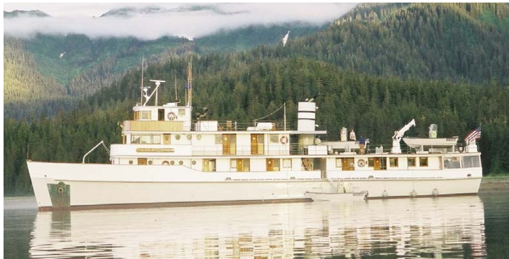
The Boat Company, incorporated in Alaska in 1979 by the McIntosh Foundation, is a non-profit educational organisation offering luxury eco-cruises on the M/V Liseron (pictured) and M/V Mist Cove through Southeast Alaska.

WM: Yes, we’ve actually done some pretty novel things. The reason we put it together back in the early days, in 1980, was that we had to gain credibility in the eyes of the Alaskan people and to gain their support. We had to be perceived as more than just ‘tree-huggers’ and we did