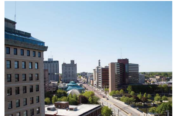
The Mott Foundation's hometown of Flint, Michigan, faces a number of community challenges that are being addressed through innovative grant-supported projects.

Second, I think you need an atmosphere that is open to partnerships . Clearly, more can be accomplished