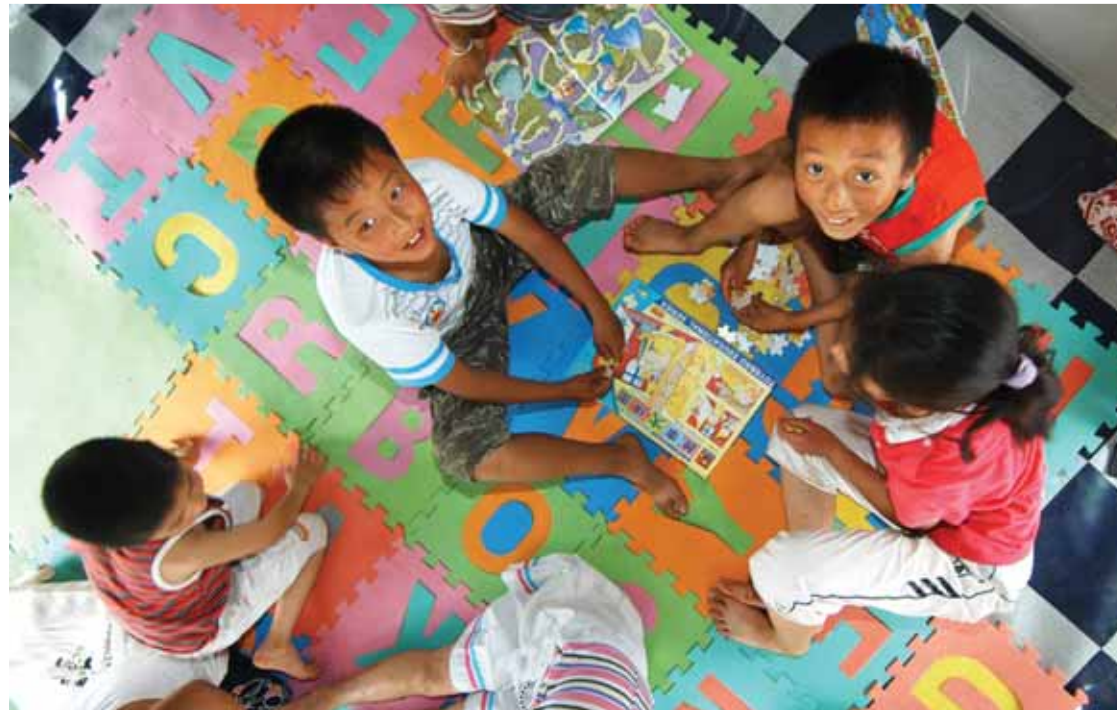
Children affected by the recent earthquake in China using the ‘child friendly spaces’ funded by philanthropic donors

A few examples illustrate that much of the ‘accepted wisdom’ about UK philanthropy comes from this grey literature. The Sunday Times Rich List Giving Index (published annually every April since 2003) is a prime source of information about the names of major UK donors, how much they give and what causes they choose to support. Annual research reports published by sector umbrella bodies, notably NCVO’s ‘Civil Society Almanac’ (known until this year as the ‘Voluntary Sector Almanac’) and CAF’s ‘Charity Trends’ contain data on many aspects of charity income and are essential fixtures on the bookshelves of anyone seeking to understand charitable giving in the UK. Influential think tank reports include the much-cited Institute for Fiscal Studies report ‘State of Donation’ (1997), which was the first to prove that lower-income households donate more as a percentage of their