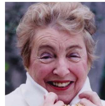
The first appointed Ambassador for Philanthropy Dame Stephanie Shirley

charitable giving, setting out plans for working in partnership with the voluntary and community sector to foster a deeper culture of planned, regular and tax-efficient giving.