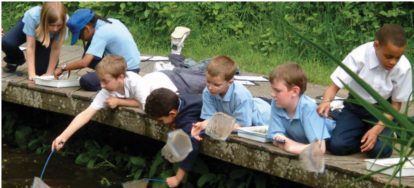
The IntoUniversity FOCUS Programme offers disadvantaged young people challenging and stimulating experiences which aim to promote a love of learning. The charity is funded by Impetus Trust.

In 2005 the government renewed its commitment to supporting charitable giving, (see Legislating for philanthropy ) laying out its vision and priorities in A Generous Society , and funding new strategic partnerships to promote efficacy in giving, including Philanthropy UK, CFN, and Giving Nation.