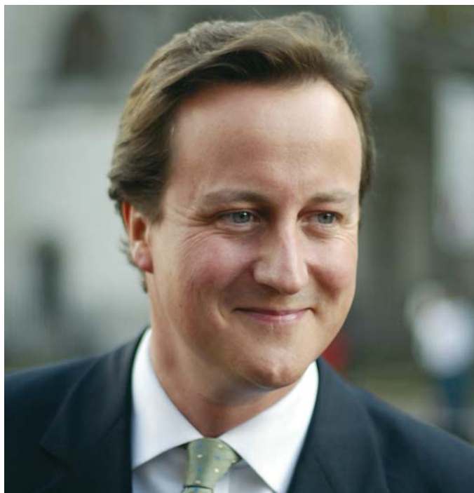
David Cameron MP