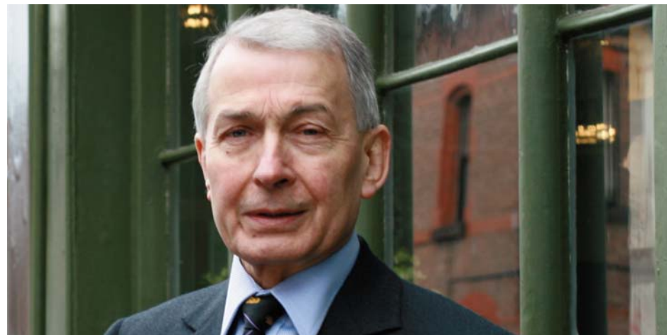
Frank Field MP