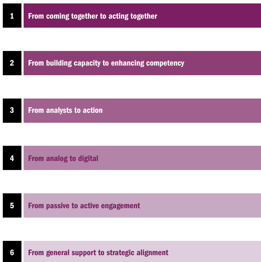
Figure 1: More than the Sum of its Parts Research Key Findings

Going from analog to digital is as much of a mindset as it is a practical issue. Access to data, and developing systems to capture/analyse and share it, are the more likely and common obstacles that are not necessarily related to cost. While sophisticated systems like those powered by Candid (the new merger of Foundation Center and Guidestar in the USA) are ideal, even smaller scaled/budget PSOs can prepare a survey and a basic Excel system to capture, analyse and share data. As such, PSOs need to adopt a more digital mindset,