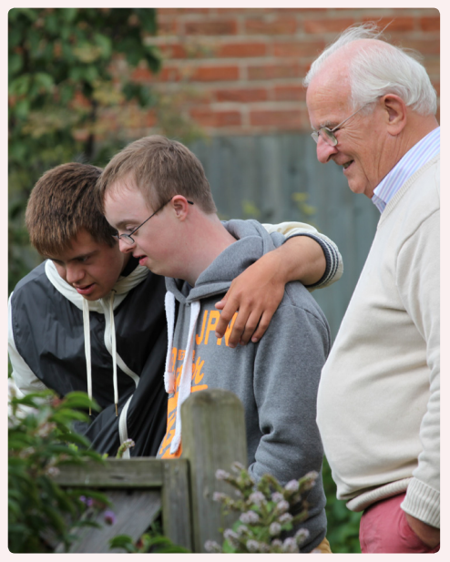
Golden Lane Housing, investment through Threadneedle

With the exception of Cook, these are all investments which I may not have been tempted to make because I like to go for different sorts of risk in my own name.