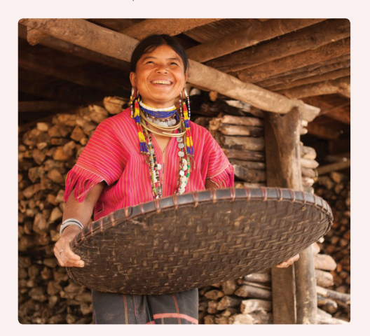
Alterfin, direct social impact investment

since used my DAF to give out grants and make social impact investments.